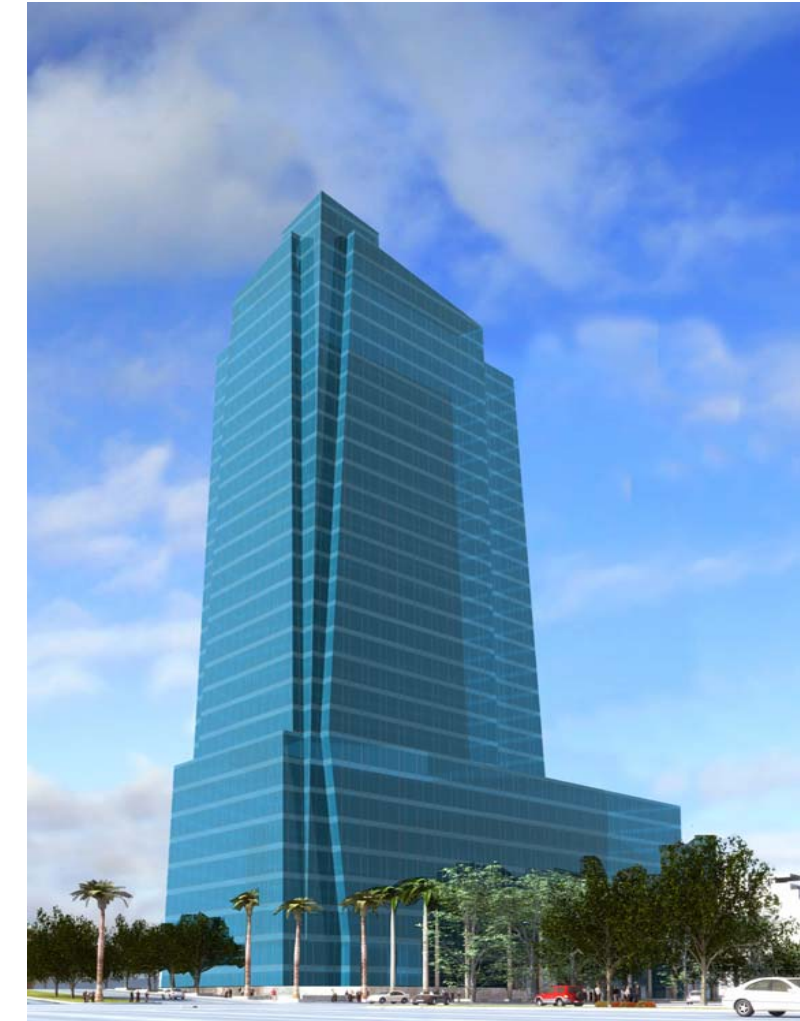
Miami 21 - Building Rendering