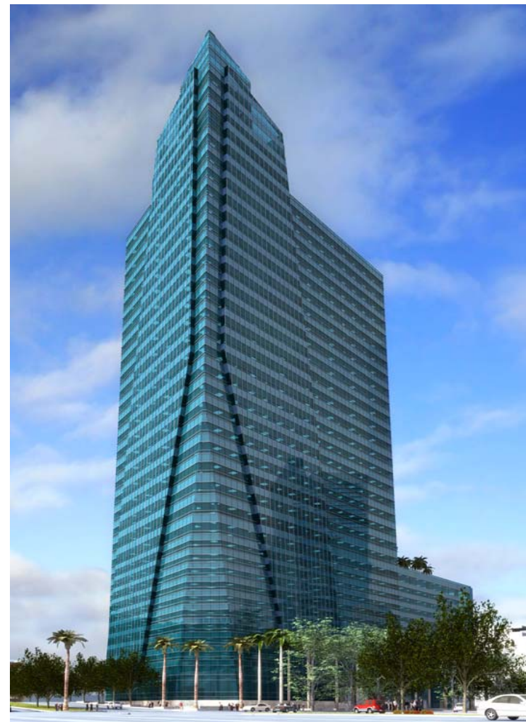
11,000 - Building Rendering